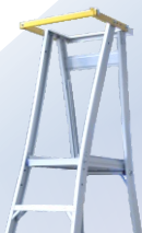
PROPG Platform Gate