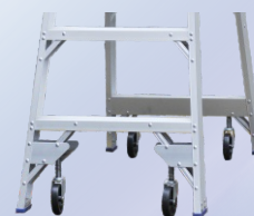
PROPWK Platform Wheel Kit