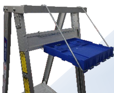
PROPTT Platform Tool Tray