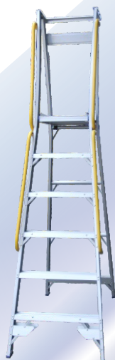
PROPSHR Side Hand-Rails